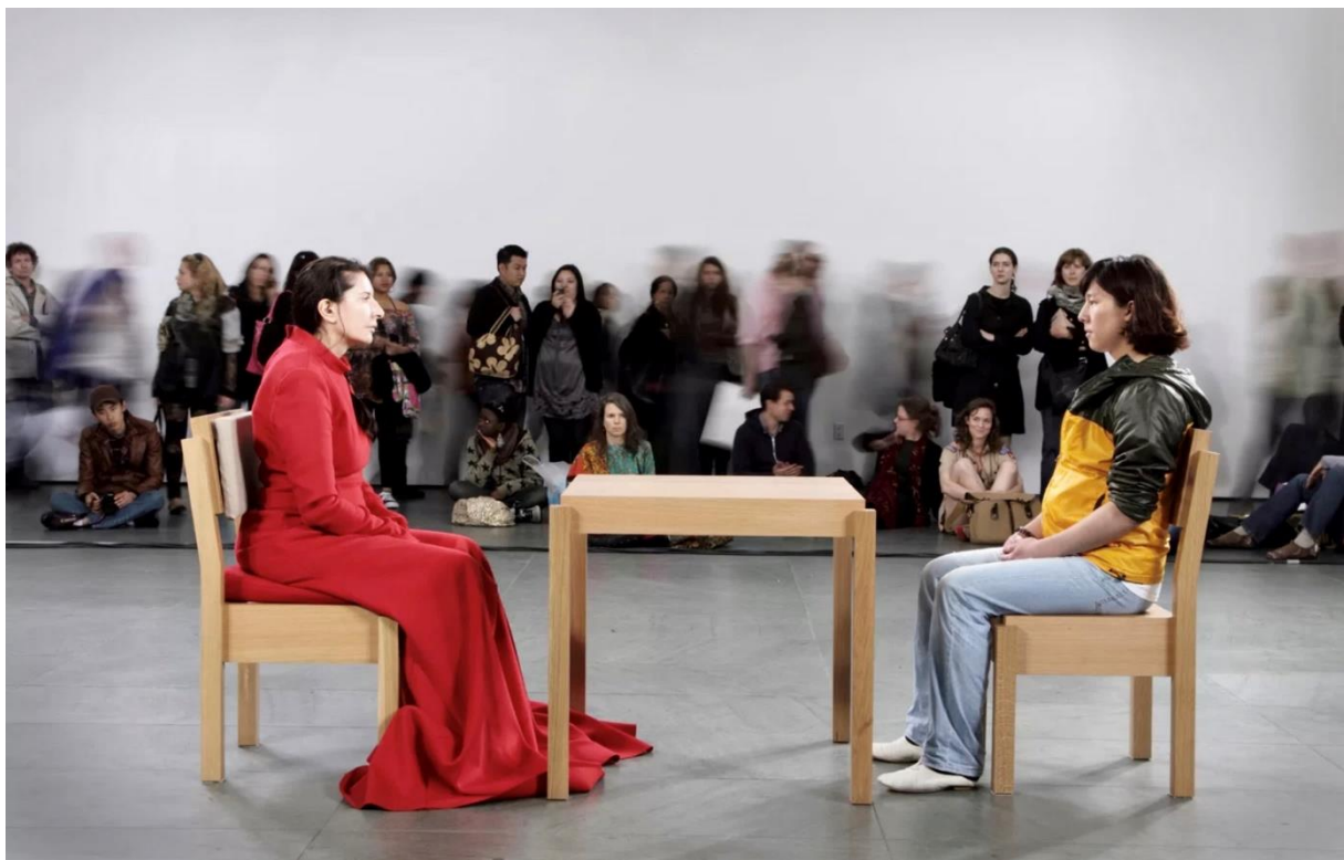
Performance “The Artist Is Present”

“Cultural Capitals” art project is carried out by presenting personal photos/audio/video materials. After the online meetings period, artists from Saint Petersburg create artworks depicting Krakow, while Polish artists present their vision of St. Petersburg.