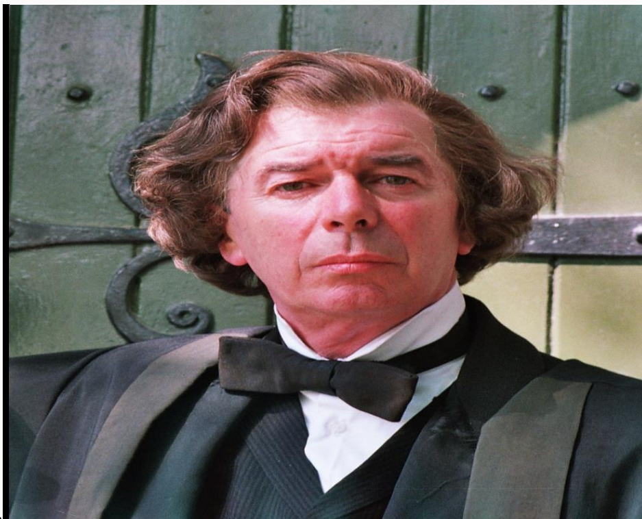
Illustration for Lewis Carroll's book "Alice's Adventures in the Wonderland"