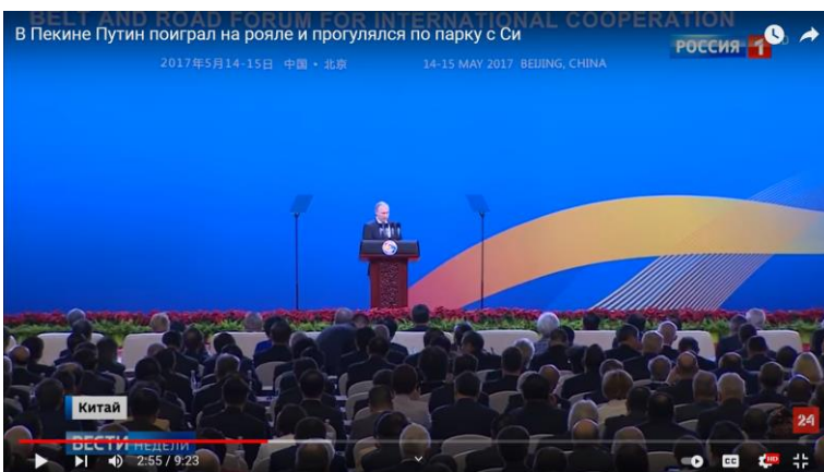
June 5, 2019. Negotiations between China and Russia