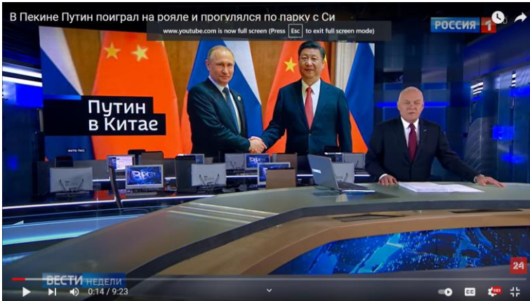
May 15, 2017. V. Putin is visiting China