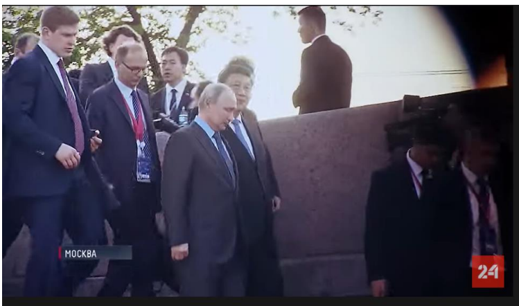
May 15, 2017. V. Putin and Xi Jinping are walking around the park in Beijing, China